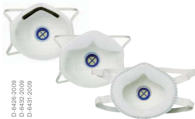
D-6426-2009 D-6432-2009 D-6431-2009

Small details, big effect: the CoolMAX™ exhalation valve was engineered to optimally guide the exhaled air out of the face piece. The extremely low breathing resistance keeps breathing easy. Effective exhalation of humid and warm air successfully prevents heat build-up under the face piece. The result: the user enjoys the highest levels of breathing comfort.